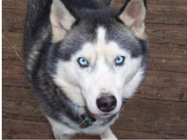
9 - Huskies are wolves that are dogs for people that are no harmful.