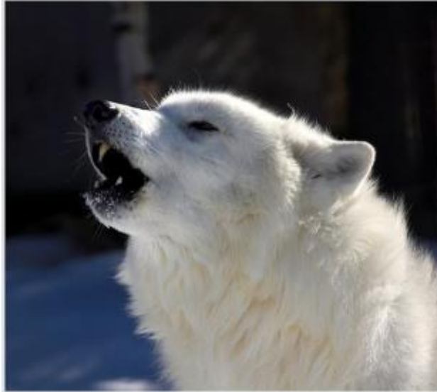
2 - Wolves are carnivores and they eat rabbits, fish, deer, moose and wild boar