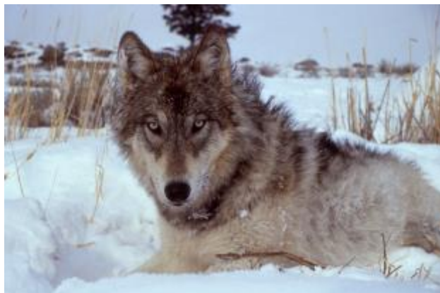
4 - Wolves live in a very cold environment and need their thick fur to keep warm.