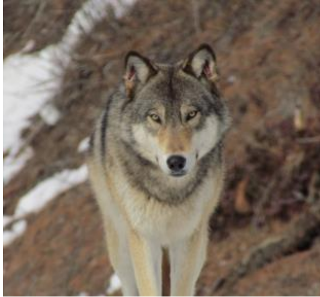
12 - All wolf have back bones.

Dogs are very similar to wolfs because dogs run as fast as a drop of water. Some dogs also hunt. Also wolfs breath with there lungs. All wolfs are Mammals.