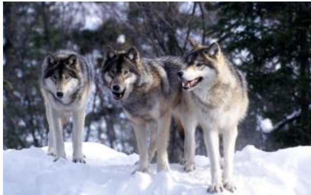
3 - All wolf packs can have up to 2-30 wolfs a pack