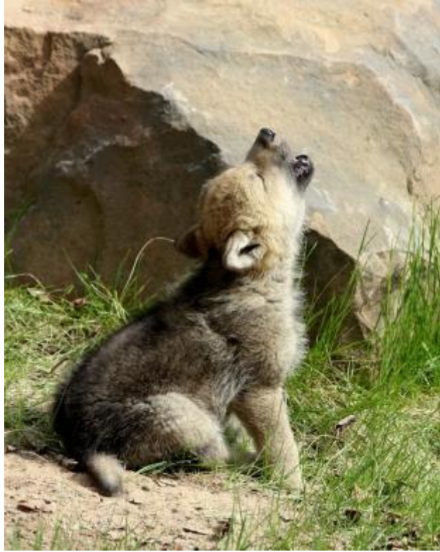
7 - Wolves give live birth to there pup or cubs.