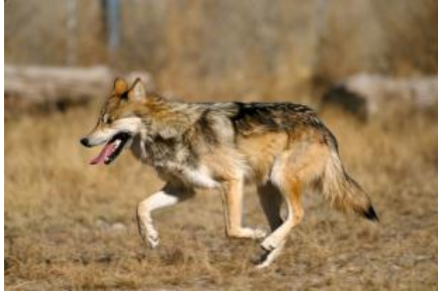
5 - Dogs bark more than wolves because dogs have evolved into the equivalent of overgrown wolf puppies.