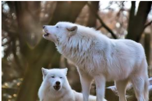
13 - When wolves howl together, they harmonize rather than sing on one note to give the illusion...

A baby Wolf is called a Cub or Pup. Highly intelligent animals with upright ears, sharp, pointed muzzles and sharp eyes.