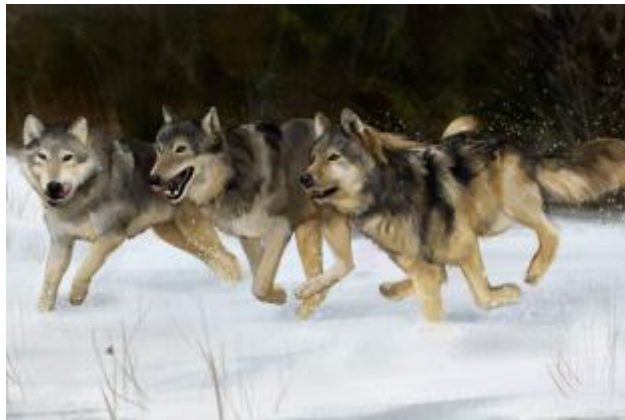
11 - Wolf pack stay together and hunt together.