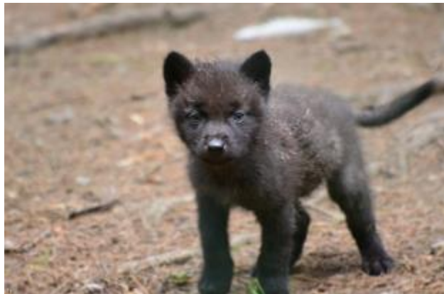
14 - A baby Cub