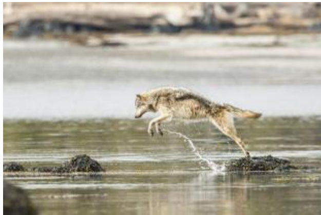
8 - There are sea wolves that live on the coast of British Columbia. Most of these wolves have never even seen a deer.