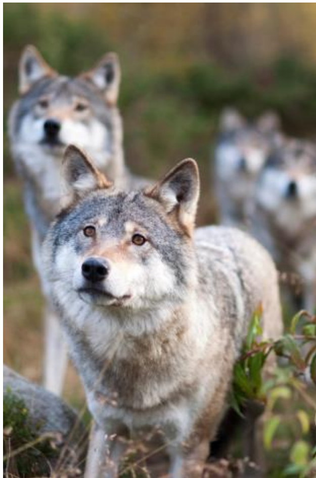
6 - Wolves are animals that hunt, Play and staying together in packs.