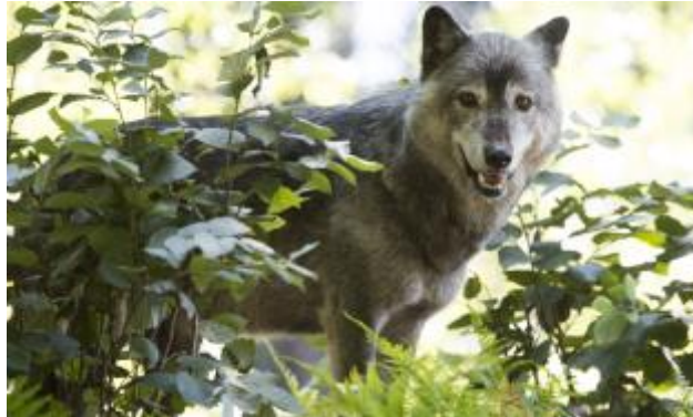
10 - All wolves are warm blooded.